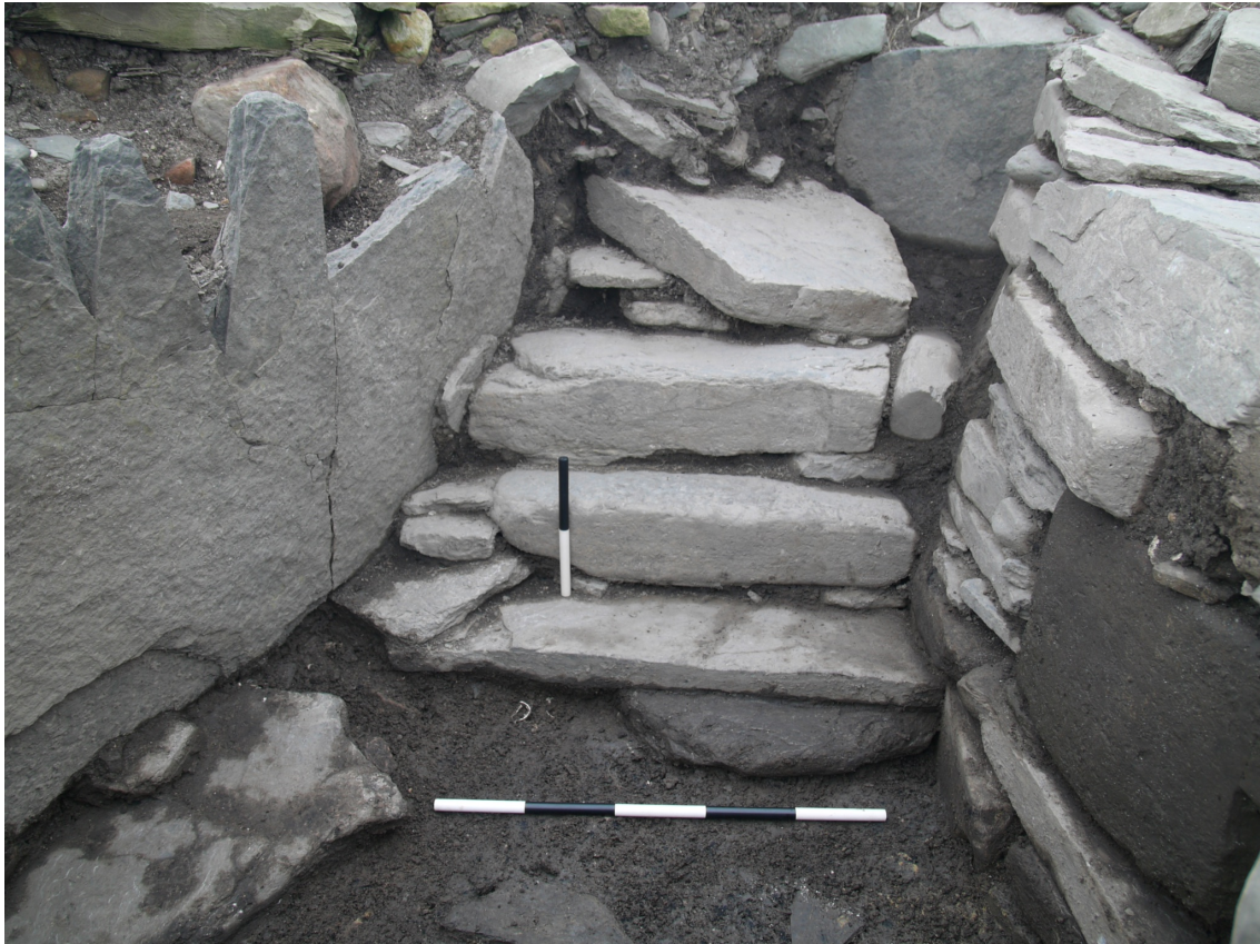
The Steps leading down into the passage of Structure 3

passage in other dry stone structures, notably the Old Scatness aisled roundhouse Structure 12 (Dockrill et al. 2015). The presence of a threshold stone in the narrow passage created by these two walls (identified at the end of the 2016 season) together with a bolt hole created in the build of [3219] clearly indicates that there would have been a physical door dividing the passage and the central area of the structure.