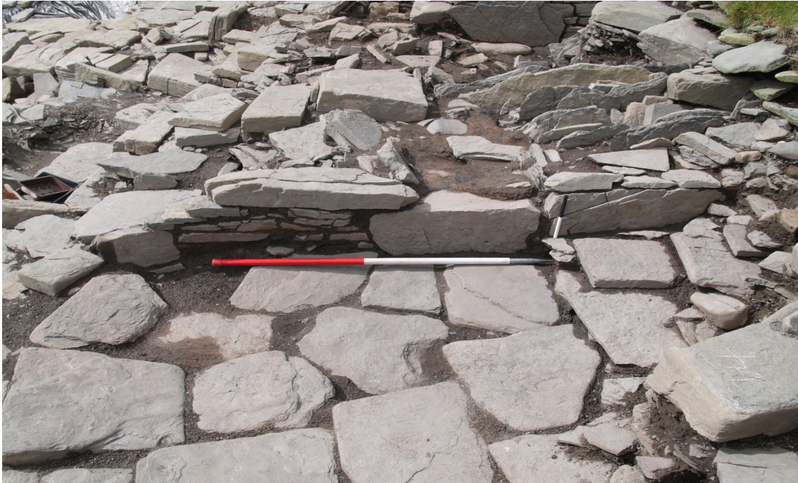
The top of the tabular set stones / orthostats [3333] and [3335] displaying signs of intense burning suggestive for the presence of a wall constructed hearth possibly representing the base of a corn dryer flue and hearth.

presence of the base of a corn dryer flue and hearth bottom set into this end wall. At the south eastern end of the structure a sequence of flagging and midden comprising of a large flag [3028], sealing a layer of dispersed flags [3029], [3238], [3254] sealed a well laid flag floor [3256] which appears to be contemporary with floor flagging [3323] at the north western end, sealed by midden [3322], which in turn was sealed by [3258].