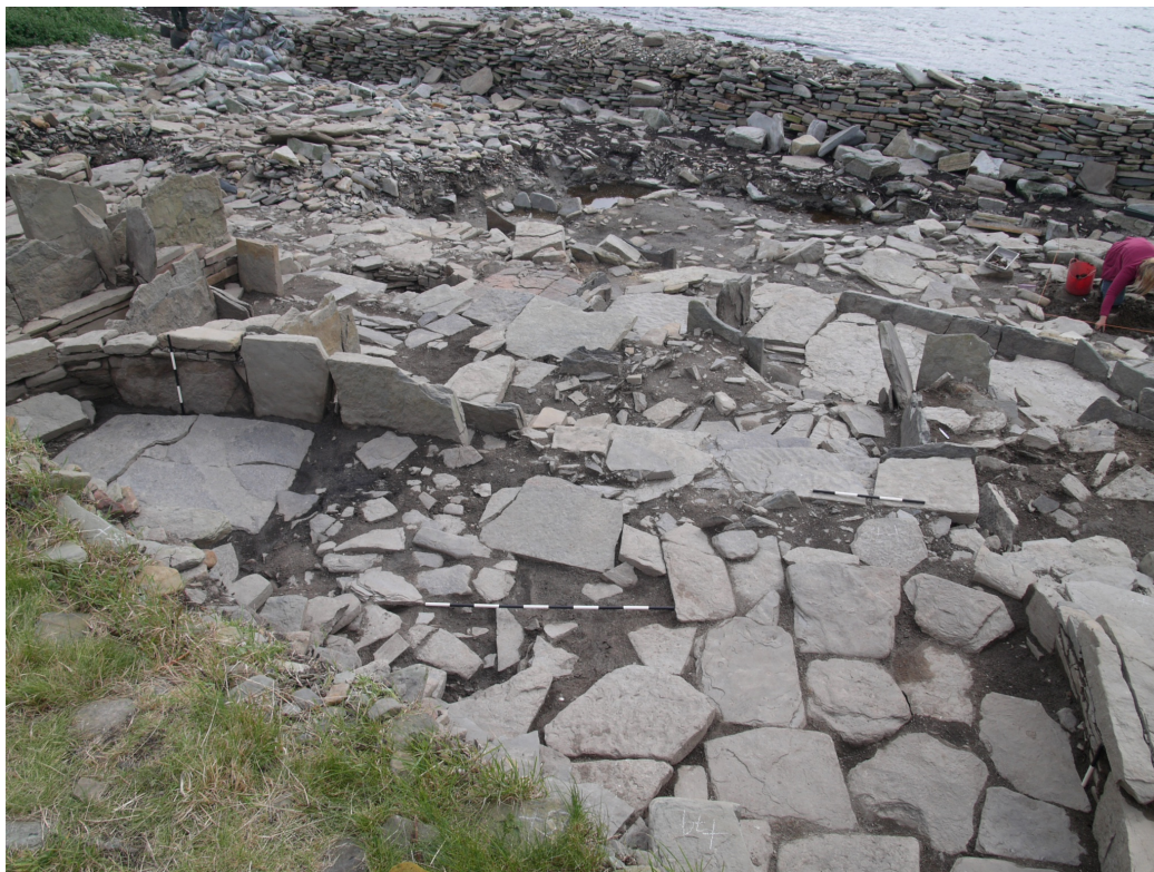
The use of orthostats as the base course for the wall of the Pictish Structure 4

The building has elements which might belong to an earlier form, in particular [051]. This wall is not quite in alignment with [1151], the wall extending from the seaward side of the