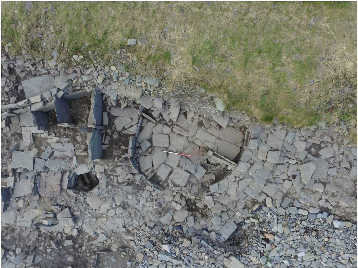
Structure 2 with the flag floor represented by [3319]].

The flag floor represented by [3319] and the hearth are clearly part of a sequence of floors representing several modifications to the building as the remains of part of a rectangular stone tank represented by orthostatic settings [3363] could be clearly seen under the flags [3319].