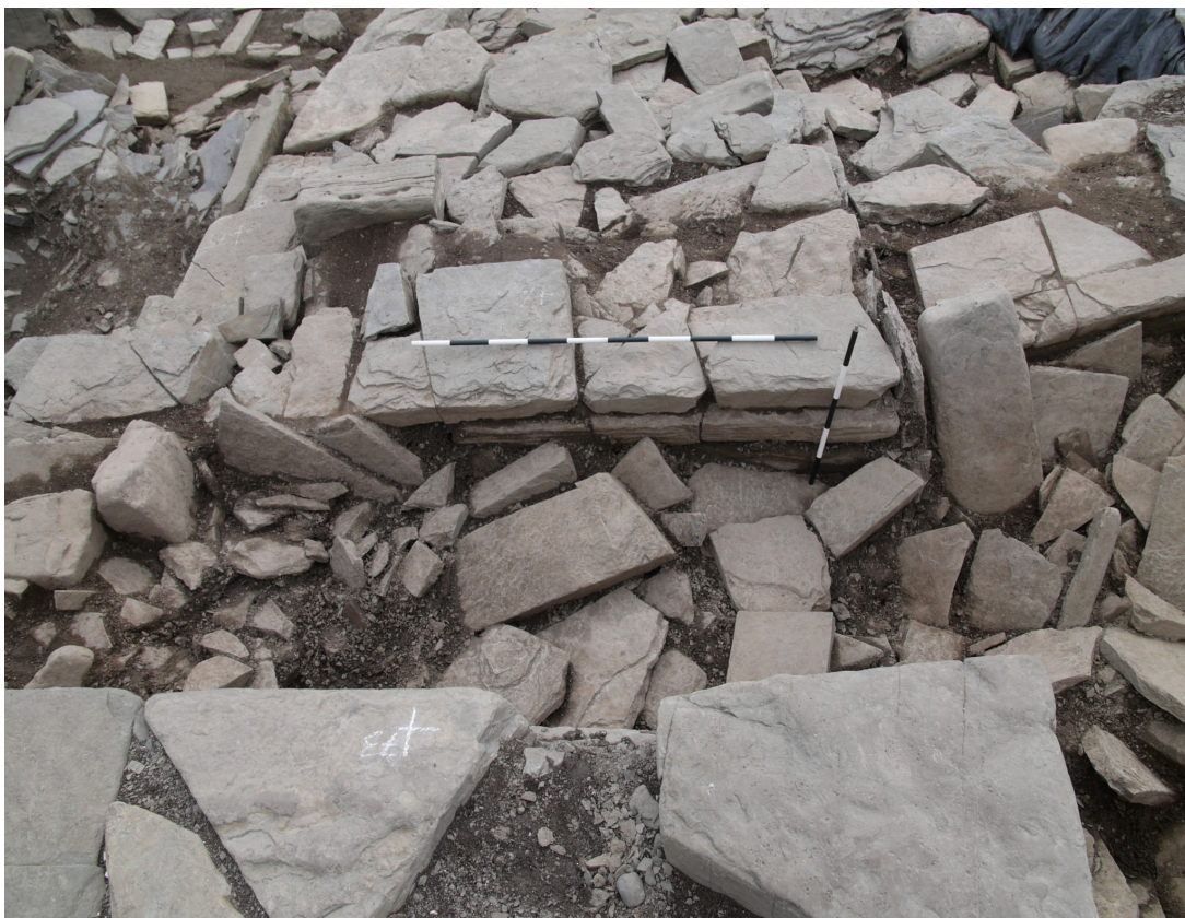
The passage to the Chambered Cairn was formed by [1020 and the seaward wall of the passage [3283.]

The further excavation of [3223] between [1020] and [3283] revealed more faunal remains including more cat bones, suggesting more than one animal, and the remains of several sheep displaying chop marks which suggested the use of a large metal blade. This deposit sealed large angular rubble [3355]. This angular rubble was also sealed by a layer of angular flags [3357] in the trench edge. The large angular rubble [3355] (sealed by this flag