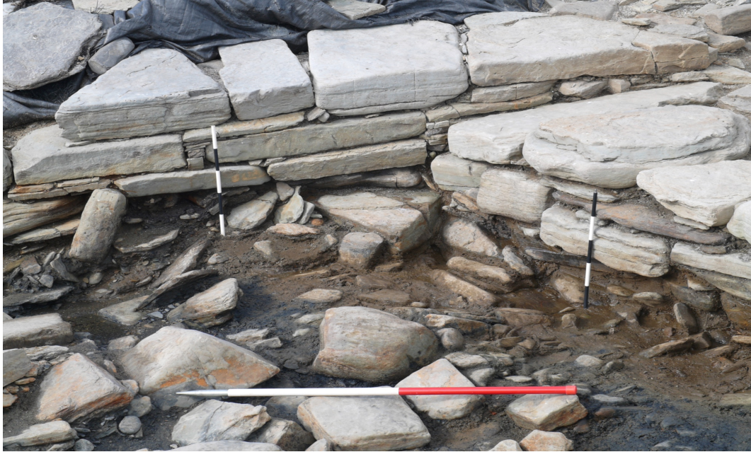
The Neolithic Casement Wall [105] and secondary wall [1117]