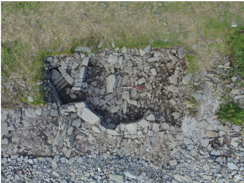
Structure 3, showing the location of the main cell, entrance and passage way.

infilling with some ashy middens interleaved consisting (in stratigraphic order) of [3196], [3214], [3221], [3242], [3242] and a dark ash midden layer [3275]. This in turn sealed a layer of horizontal stones (possibly purposefully laid) which sealed a dark midden [3346]. The contexts in this lower sequence were found to contain evidence of metal working with finds of slag, possible crucibles and mould fragments together with fragments of copper alloy. An orthostat [3228] parallel to [3198] divided the interior of the cell. In the western zone defined by this orthostat the following sequence was excavated, comprising of ash based middens with significantly less rubble [3196], [3229], [3248], ash [3248], black ash [3269] and [3270].