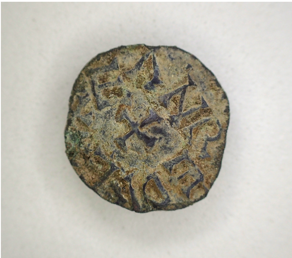
Coin of EANRED found in the upper infill of the passage way of the Chambered cairn.

site and the associated burial conditions are extremely valuable. The nature of the form of the cairn is intriguing; the circular nature of the casement wall, the size and structure of the monument might be reflective of a form of Maeshowe type cairn. Examination of other excavated examples demonstrates some similarities to the Bookan Chambered cairn. Only further work will determine how this cairn fits into the Orcadian typological sequence. An analysis using new visualisation recording technique of the structure, infill and deposits together with questions of recent research such as Lawrence's (2012) doctoral thesis on the Isbister osteological assemblage heighten the importance of this component of the site.