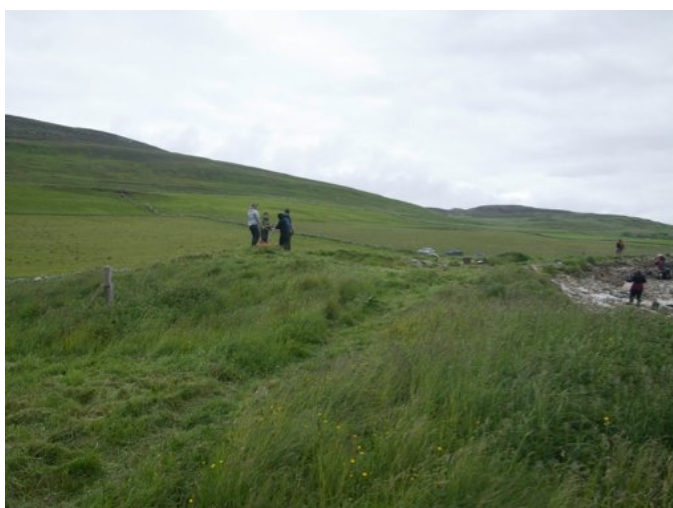
The Knowe of Swandro looking to the East

a stony mound', this knowe has generally been considered to be the remains of an Iron Age broch. At the top of the mound a crescent-shaped ridge facing towards the sea, which looked like the disturbed remains of a curving wall, surrounded a level area. RCAHMS records suggest it has been investigated at some point in the past but there is no published record. The mound may have been disturbed during Radford's investigation of the nearby Westness Norse houses in the 1960's (Radford 1962, Wilson and Hurst 1965). Assessment over several seasons has shown that this mound is actually the remains of a Neolithic chambered cairn, with a buildup of subsequent Iron Age settlement (DES 2010, 2011, 2012, 2013, 2014, 2015)