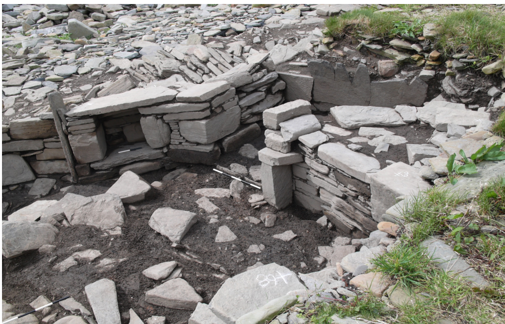
The doorway separating the passage from the main cell of Structure

passage in other dry stone structures, notably the Old Scatness aisled roundhouse Structure 12 (Dockrill et al. 2015). The presence of a threshold stone in the narrow passage created by these two walls (identified at the end of the 2016 season) together with a bolt hole created in the build of [3219] clearly indicates that there would have been a physical door dividing the passage and the central area of the structure.