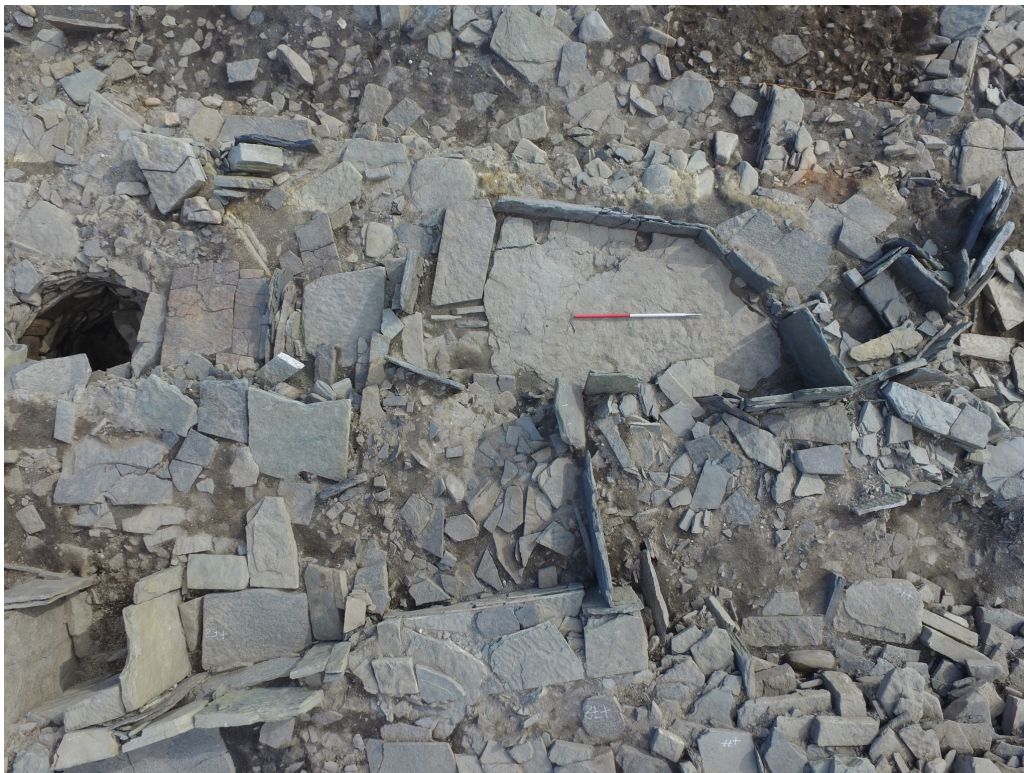
The Paved floor [3365] of the cell and the two post settings.

The floor of the cell was formed by single flag [3365], which was made to fit the cell. Several notches had been cut into the flagstone which, it is suggested here as representing post settings (see photo below). It seems likely that if this assumption is correct, that these posts would have supported a mezzanine level around the circumference of the structure. The presence of such mezzanine circumferential structures was suggested by Middle Iron Age remains of Structures 12 and 14 at Old Scatness, Shetland (Dockrill et al 2015, 67-103 & 459-460).