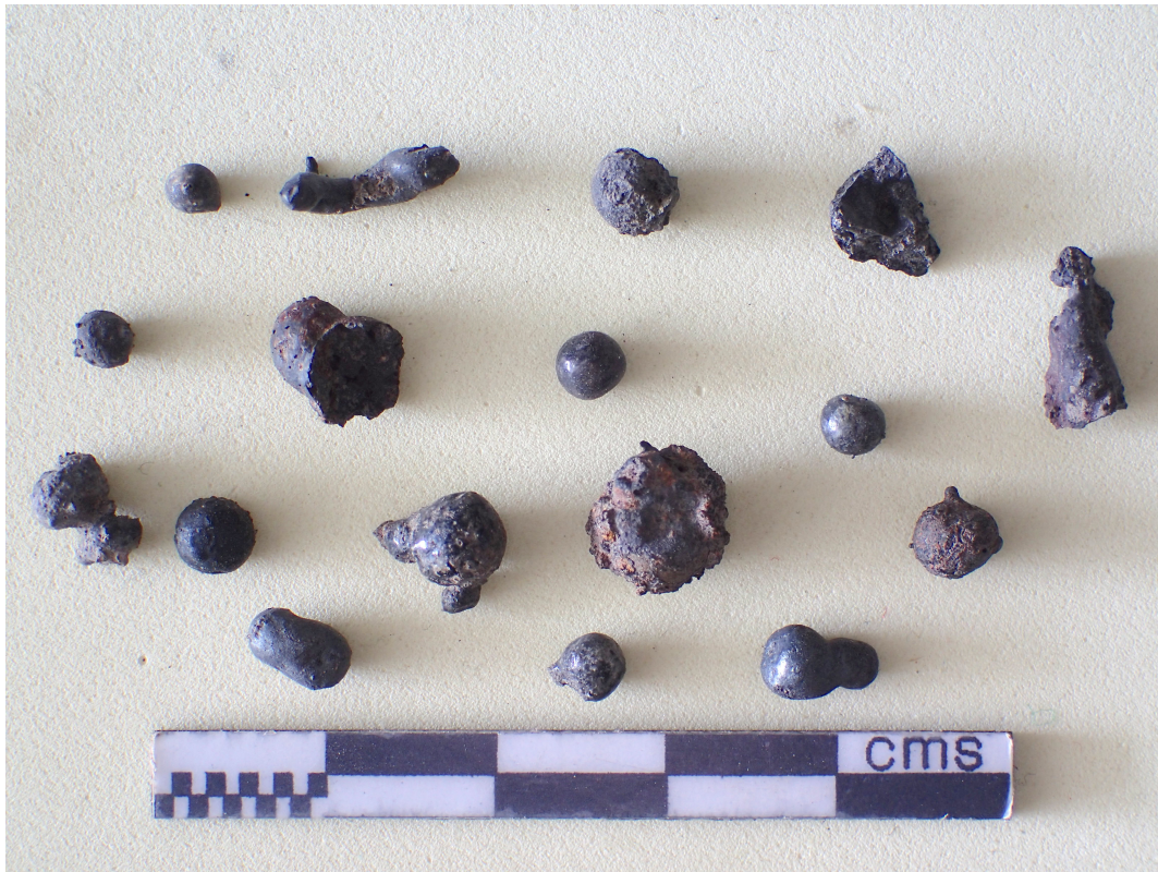
Spheroidal slag produced by fire welding indicating evidence of sophisticated iron working.